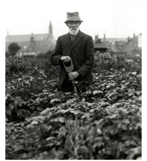
Tending allotment, Saltcoats, 1940 (UGC222)