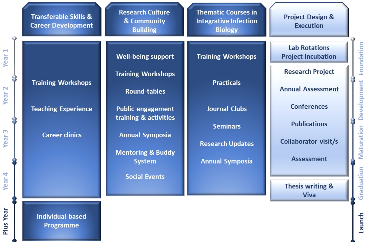
Figure 2. The “T” training strategy (A) and the PhD programme at a glance (B). For details of training workshops, seminar and round-tables please see timetable in Annex 2.